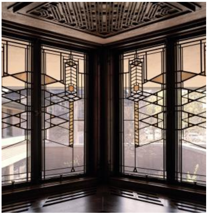
Robie House, Living Room Prow Window