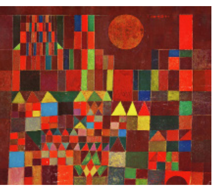
Castle and Sun (1928)