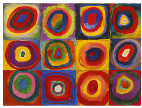
Color Study, Squares with Cocentric Circles (1913)

Composition with Large Red Plane, Yellow, Black, Grey and Blue (1921)