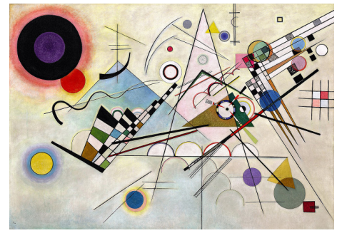
Composition 8 (1923)